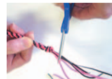
Trim Excess CraftLace™