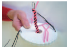
Remove Project From Wheel